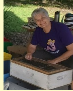
Harvesting vermicompost from well-fed worms