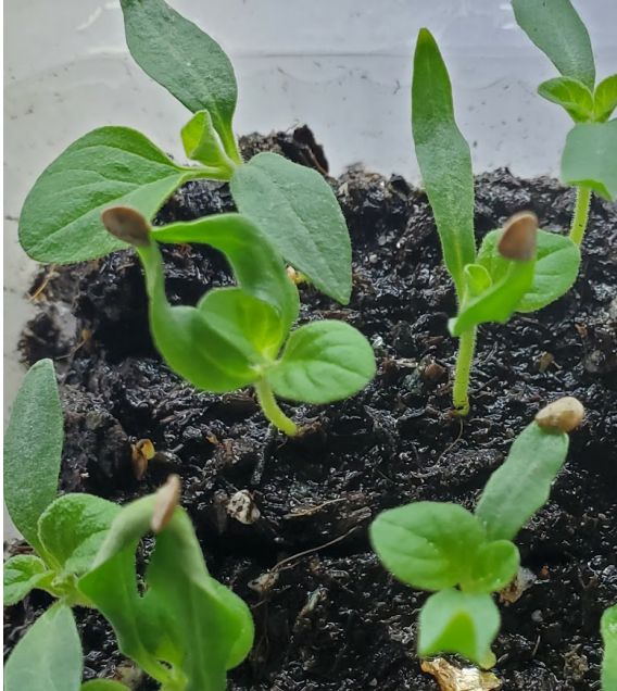
Seedlings growing in the HRS

More heat tolerant peppers, eggplants and tomatoes will be ready for your gardens on September 17. Vegetables that thrive in cooler weather , such as broccoli, collards and kale, will be ready to transplant October 8. Of course, dates will adjust based on seasonal temperatures.