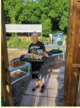
A buffet for worms