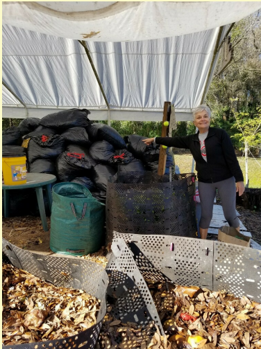
The leaf gatherer